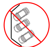
Multiple Vehicle Diagonal Parking Prohibited